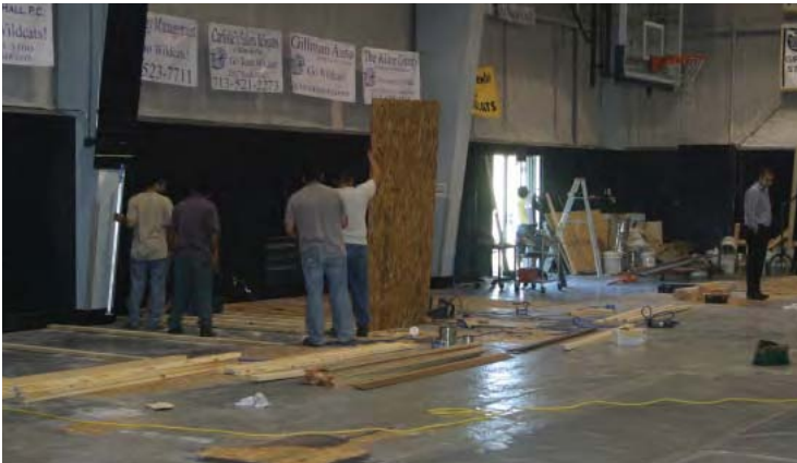
Construction in progress on the new gym floor.

Westbury Christian School has only had one capital funds campaign in the last twenty years. That campaign netted approximately $2.2 million and resulted in the construction of a critically needed 25,000 sq. ft. building. WCS has recently embarked on another capital campaign of