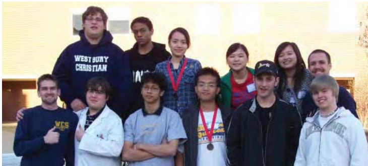
High School Group