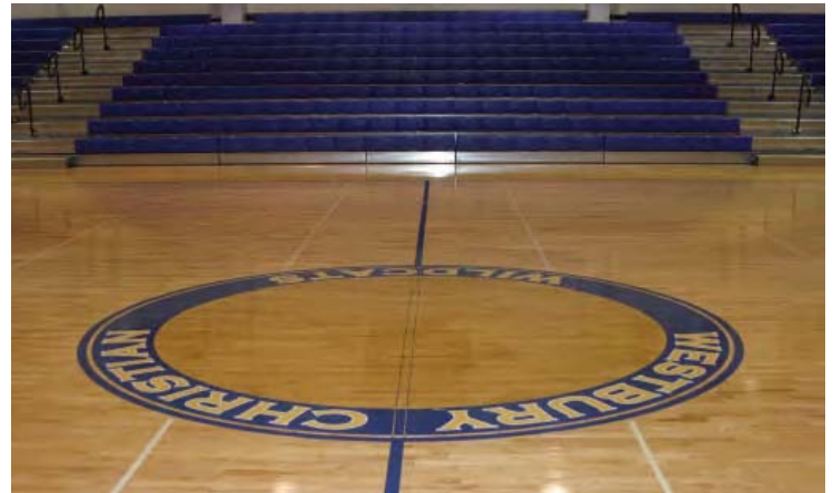
The new court provides a shiny high professional grade wooden floor and comfortable bleachers for Wildcat fans.

PLEASE be a friend and help in this "MATCHING CAMPAIGN." Thank you.