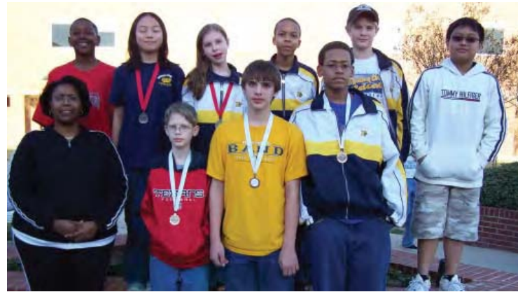
Middle School Group