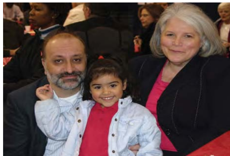
This smiling kindergartener is joined by her grandparents for the annual Grandparents Day which coincides with Valentine's Day.